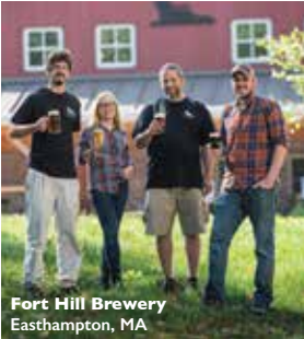
Fort Hill Brewery Easthampton, MA