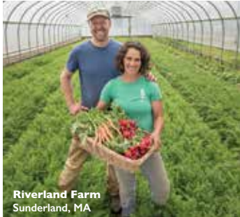
Riverland Farm Sunderland, MA