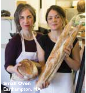
Small Oven Easthampton, MA

River Valley Co-op is a full-service grocery store and deli specializing in fresh, locally grown foods and products. Stop by and see what our local farmers, bakers, and brewers delivered today!